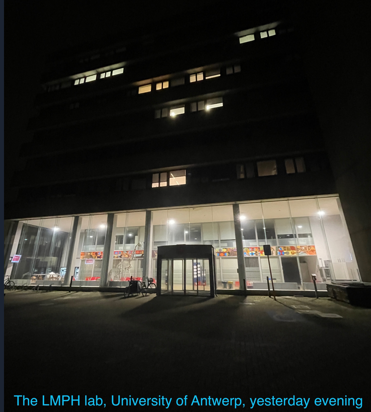
The LMPH lab, University of Antwerp, yesterday evening